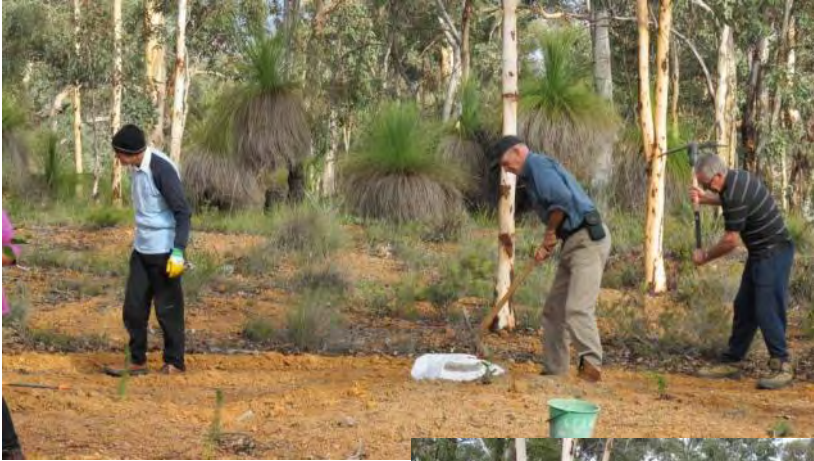
Left and below: Members tree planting in the Dawn Atwell Reserve.

The picks indicate the hardness of the soil.