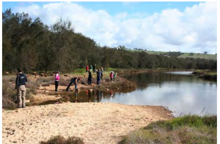
Above: The Millennium Kids looking at birds, weeds, and the macro-invertebrates in the Avon River