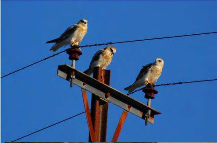
Left: Three juvenile Black-shouldered Kites on the old telegraph line in Cobbler Pool Road.