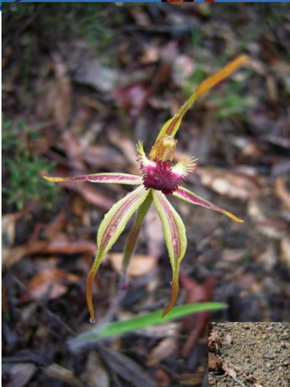
Above: photograph of a Caladenia magniclavata orchid in the Wongamine - taken by Lyn Phillips of Wongan Hills.