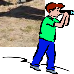
Left: The bird observers on the banks of the Avon River