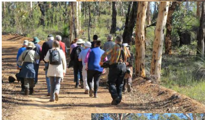
Left: A casual walk in the Dawn Atwell Reserve, with Neville describing the intricacies of our native flora