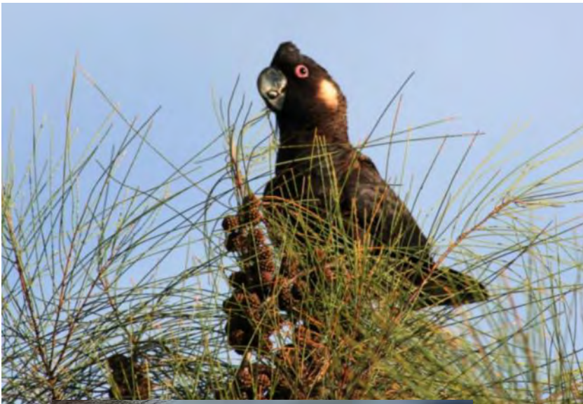
Below: Male Carnaby's White-tailed Black Cockatoo feeding on Allocasuarina sp., Majestic Heights