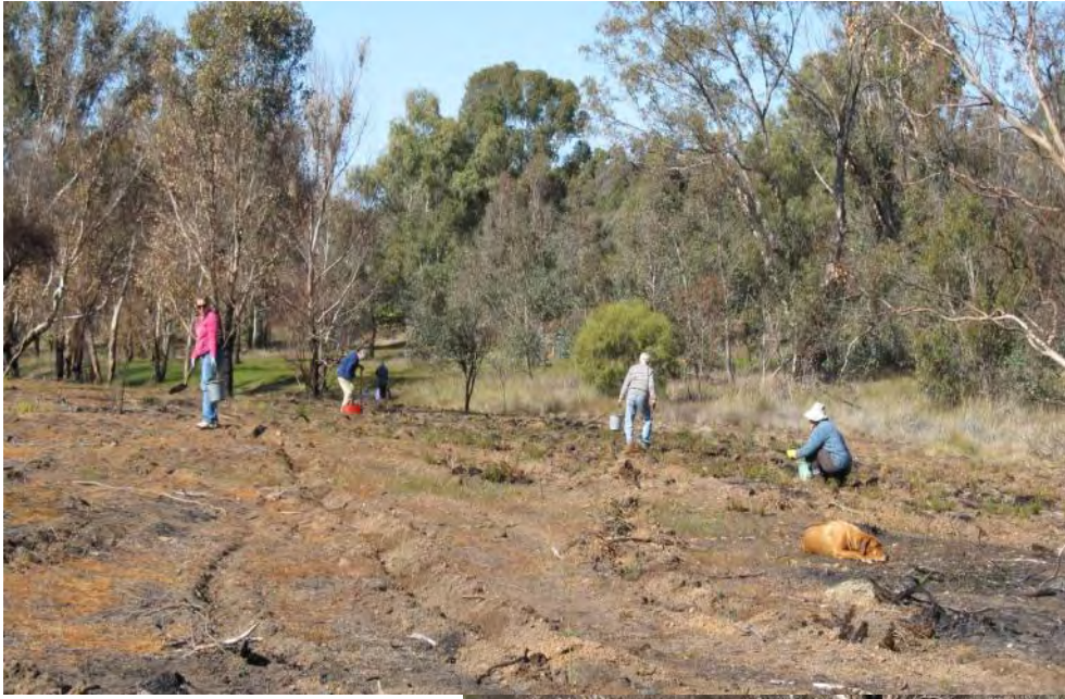
Photos of the Club tree planting at the Malkup Brook Reserve, very ably assisted by Reserve neighbours, young and old.