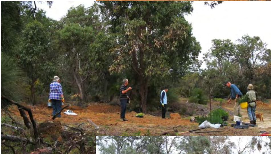
Above and right: More photos of the tree planting day at the Dawn Atwell Reserve