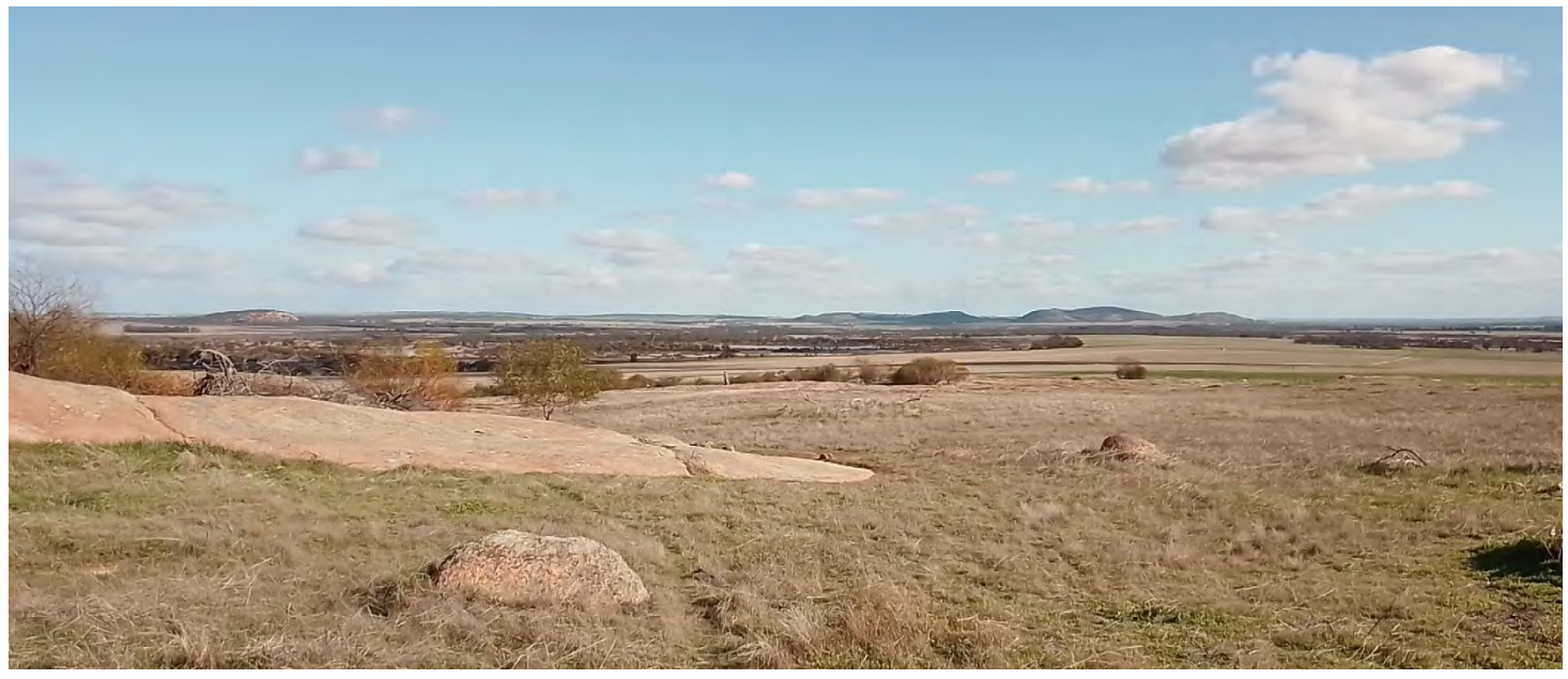
Above: General view of the confluence of the Yilgarn, Lockhart and Salt Rivers, and Mt Caroline and Mt Stirling