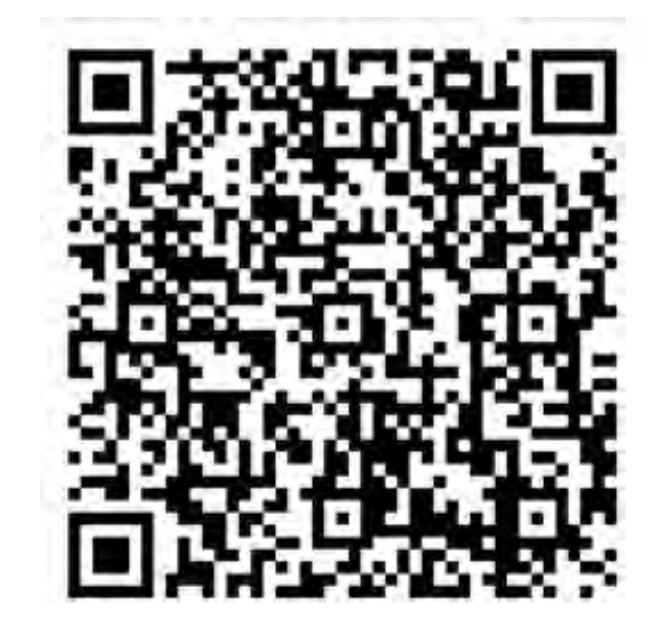
Above: Scan the QR Code to sign the On-Line petition