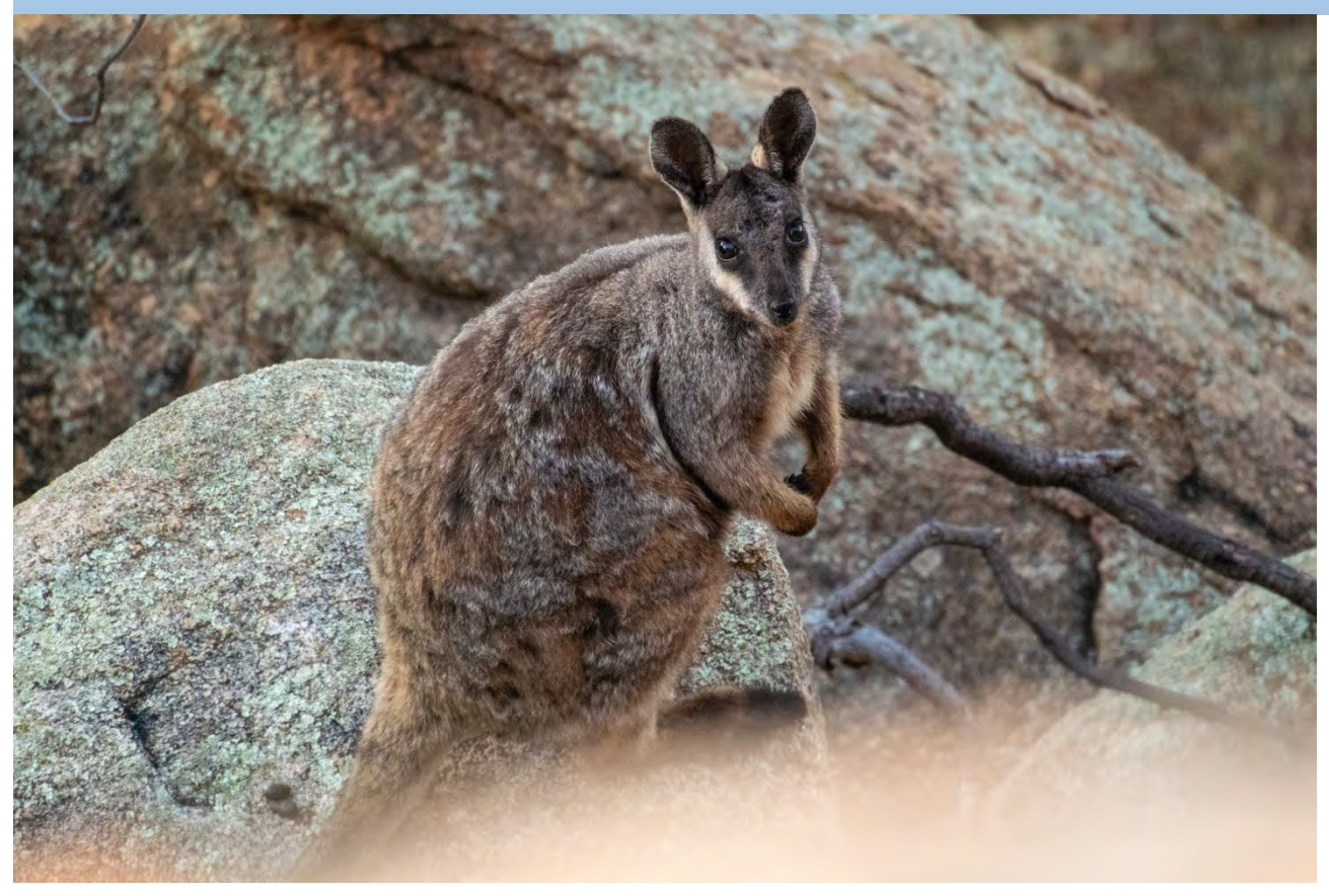
Above: Black-flanked Rock-wallaby