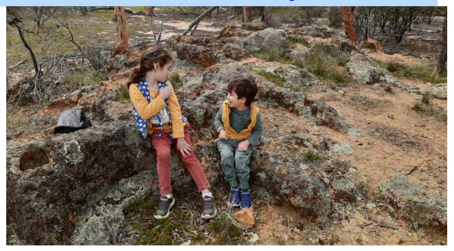
Above: A bush picnic. Below: What surprises there are in the bush