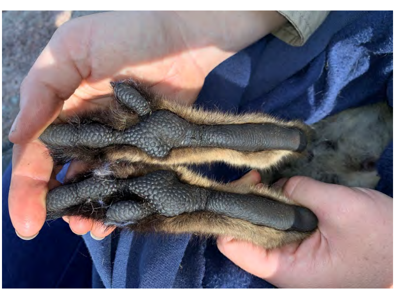
TNC News August 2023

Right: The unusual pads of the Rock-wallaby that allow them to climb near-vertical rocks