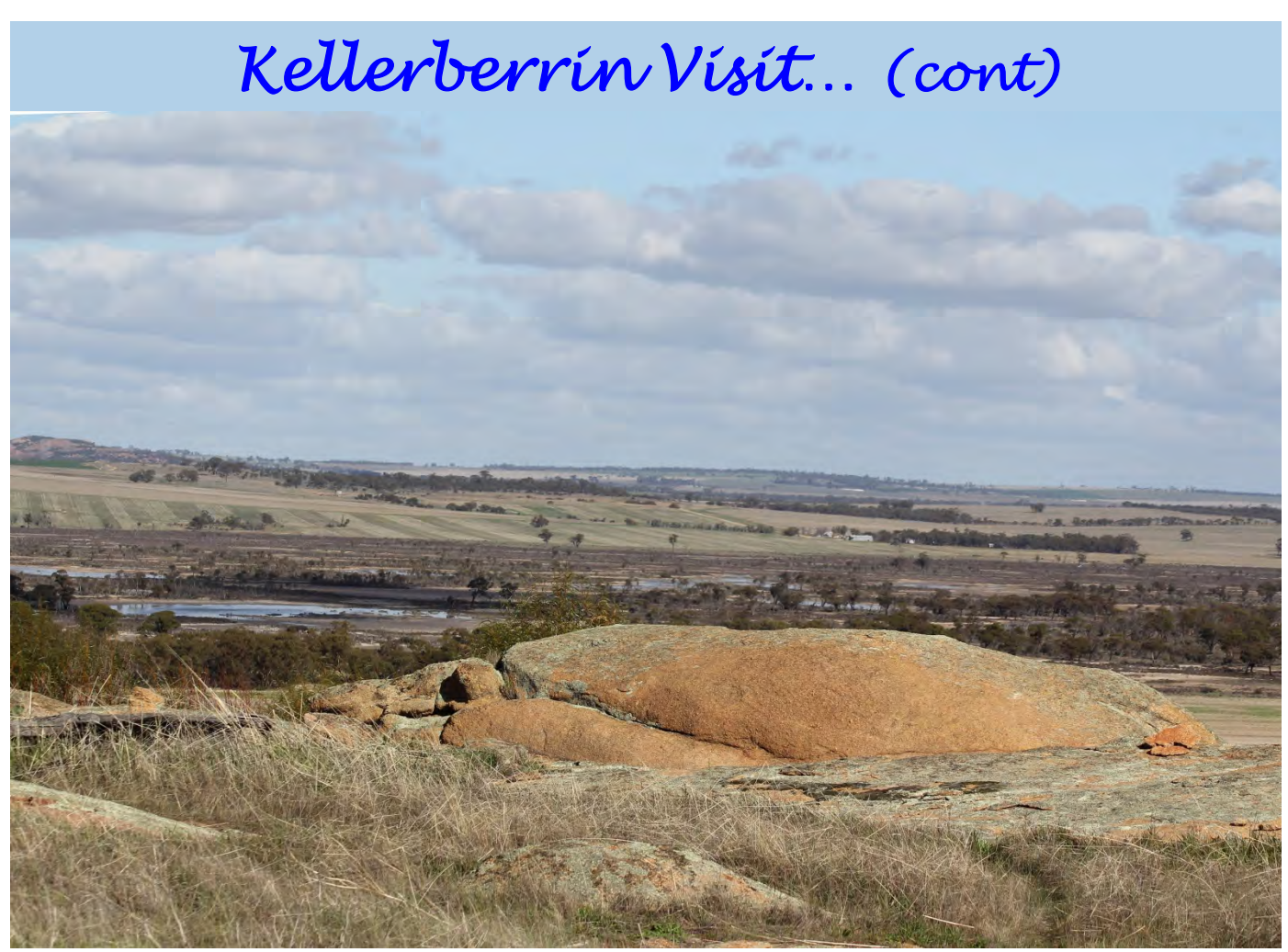
Above: The confluence of the Yilgarn, Lockhart and Salt Rivers below the Cole property.