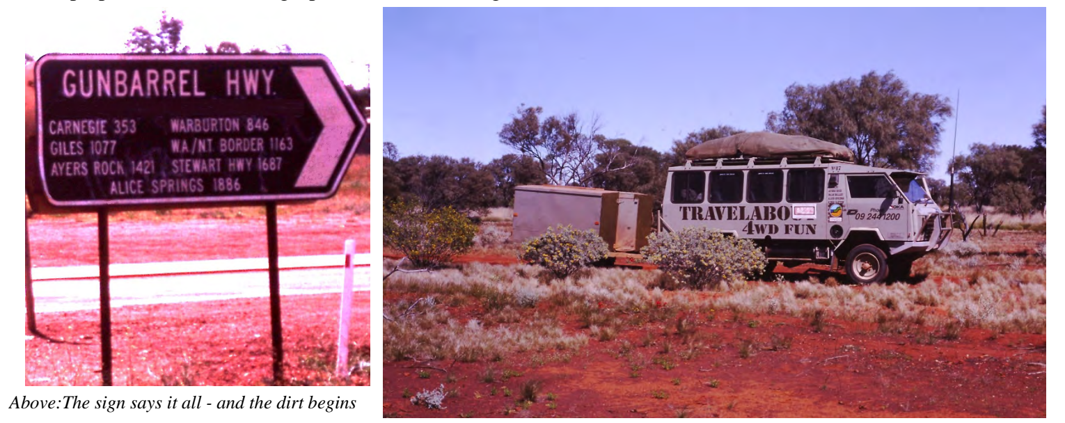
Above: The OKA loaded up and on its way

The first overnight stop was at Nallan Station (vicinity of Cue) in shearer's quarters. A roster to assist Mike with preparation and cleaning-up after meals was begun.