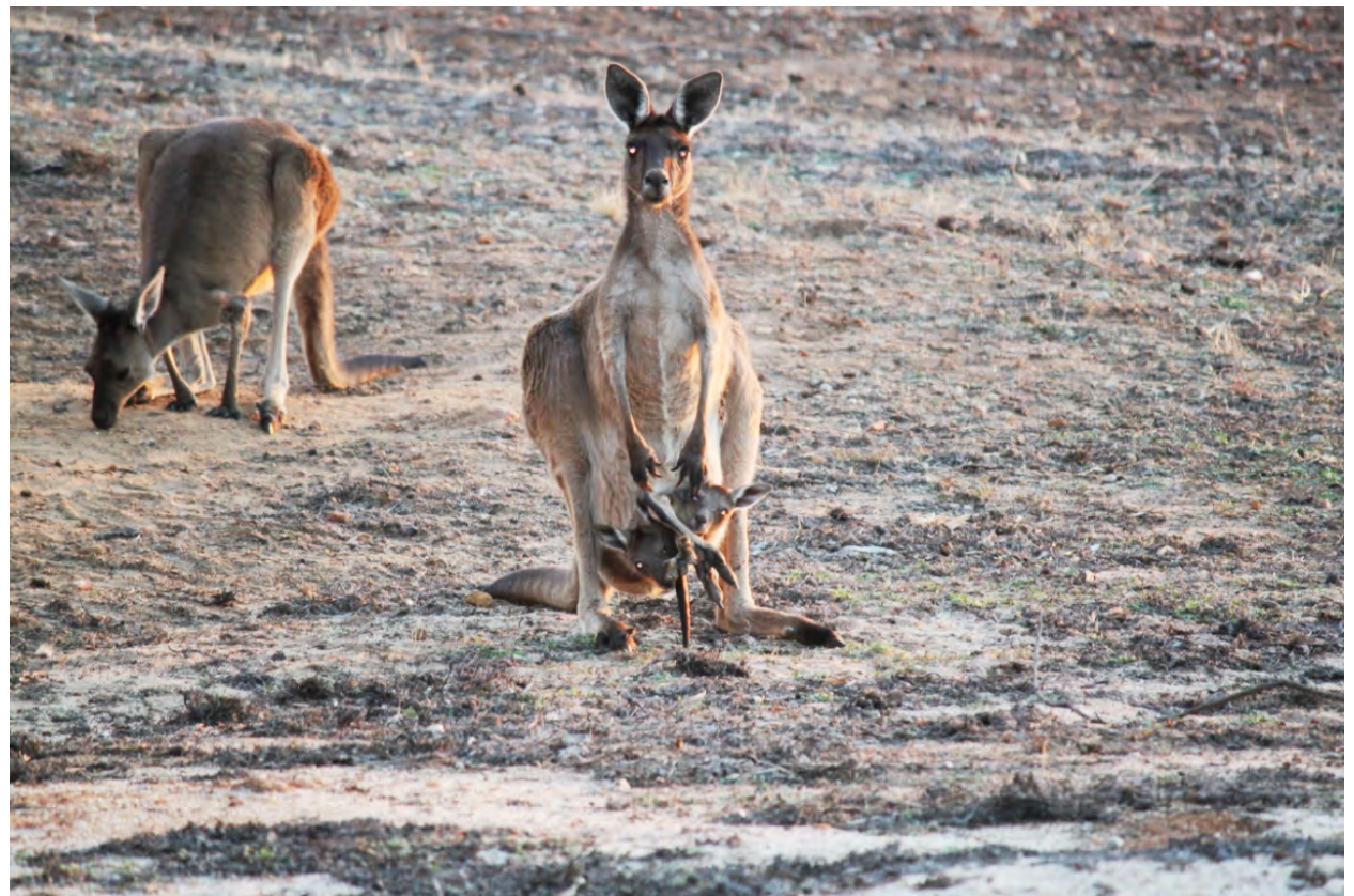
Above: Twins making this mother's life uncomfortable