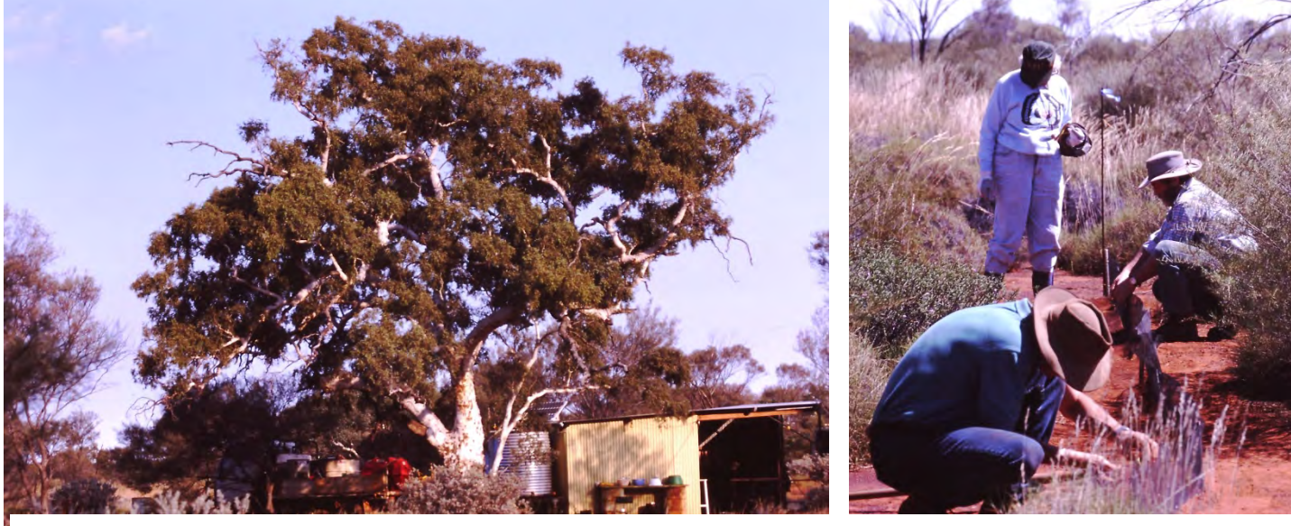
Above: Eagle Bore Research Centre

Sunday 6 September - A sample from a trapline is as follows: Jewelled Gecko, Dunnart, Sandy Inland