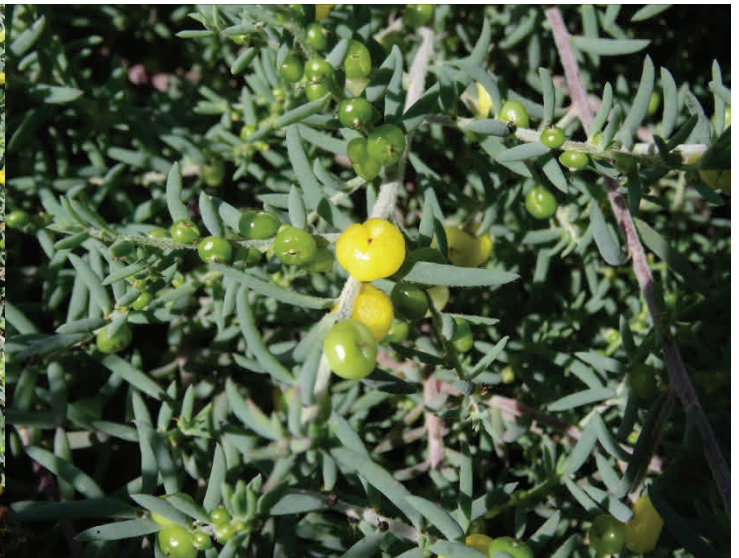
Above - the fruit