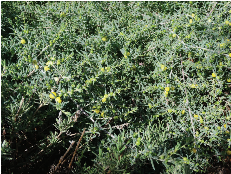
Above - the whole plant

The species is sold as a bush food plant, the fleshy fruit being regarded as edible; I have eaten it and found it to be sweet and salty. However, there are reports of the leaves of plants growing on sodium chloride rich soils often being very high in calcium oxalate, the leaves have even been expected as being toxic to stock due to this chemical. I’m not sure if the fruit has the same substance, I doubt it, as it is clearly eaten and spread by birds; if it does have calcium oxalate then Enchylaena may not be more dangerous than rhubarb.”