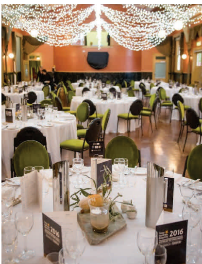
Left: The Memorial Hall looked resplendent for the Awards Dinner