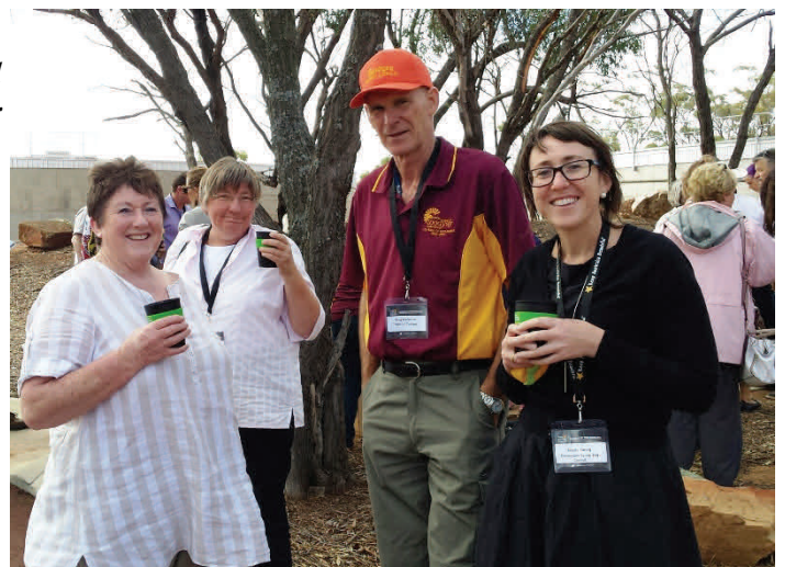
Right: Tour of Pelham Res.-Triabunna