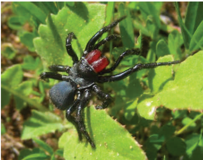
Above: Mouse spider