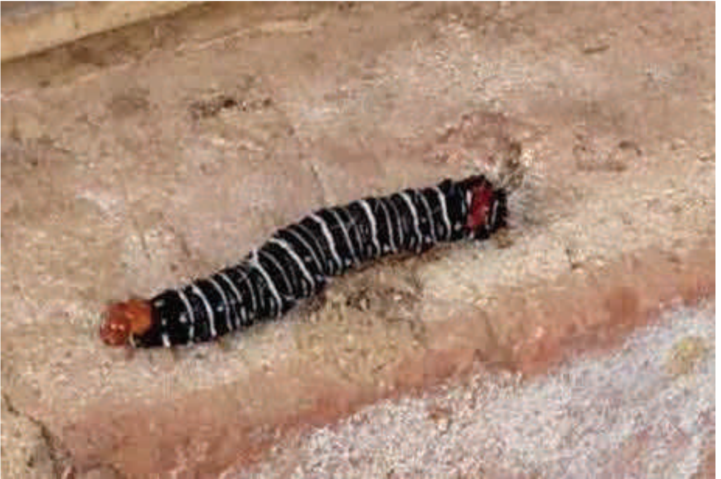
Above: Wanderer Butterfly Caterpillar larvae, photographed on brick paving