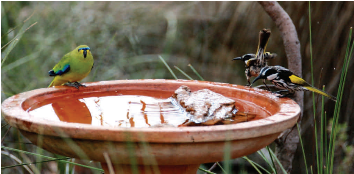
Above: Do I have to share ? An Elegant Parrot appears to have a look of disdain with having to share the bird bath with two White-cheeked Honeyeaters.