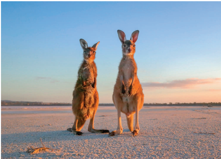
Above - Mudskipping and Left - Orphans.