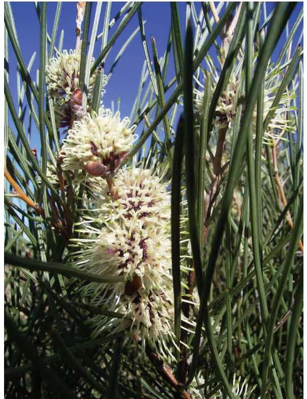
Left: Grevillea petrophiloides; and Above: Hakea Multilineata