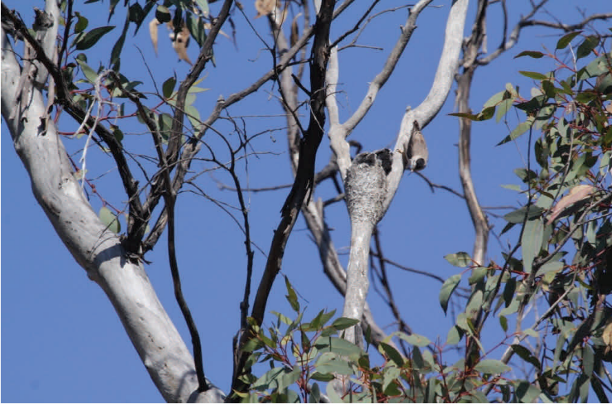
Above: Varied sittella at nest in Dawn Atwell Reserve