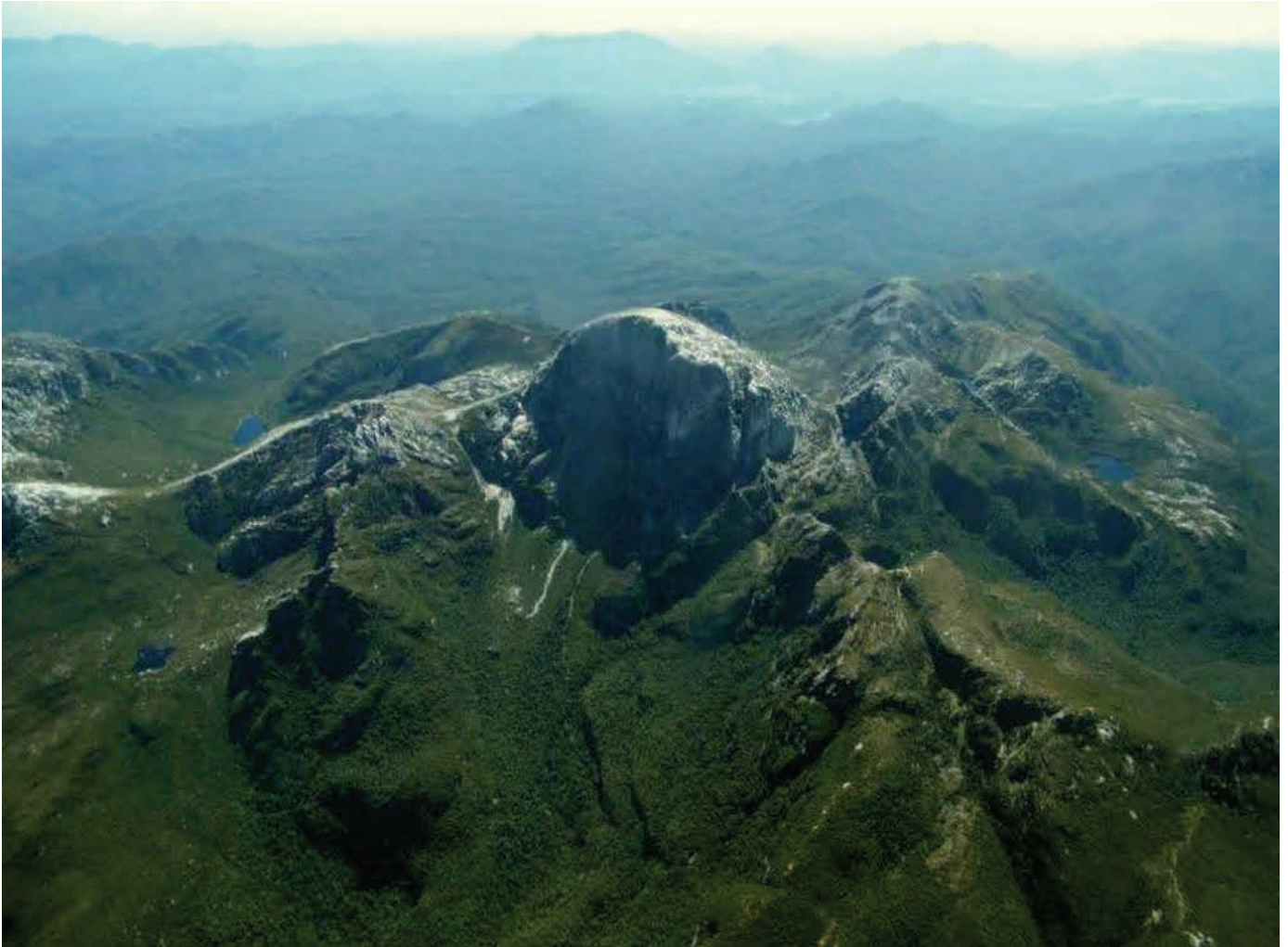
Above: Frenchman’s Cap, Tasmania

Frenchman’s Cap, a stunningly beautiful yet challenging, often snow-covered peak, isn’t far from Queenstown in western Tasmania. This mountain is surrounded by stretches of boggy button grass plains and cool temperate rainforest dominated by myrtle beech ( Nothofagus cunninghami ). Interspersed one finds Pandanus, Leatherwood, Sassafras, and Antarctic Tree fern. The forest floor of slowly decomposing fallen trees is covered in low light-tolerant species such as mosses and ferns with an accompanying typical understorey of Horizontal Waratah and Native Laurel. A rich biodiversity – all well adapted and in harmony with the environment.