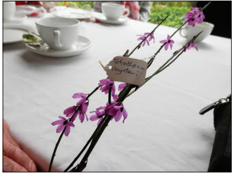
Photos clockwise from left: Bob Dixon at Wyening; specimen of Tetratheca paynterae; Ray Paynter photographing Tetratheca paynterae , taken September 1994; monolith at Windarling Range near the type location, Tetratheca paynterae