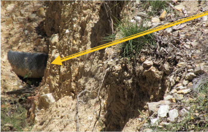
Left: A tyre rears its ugly head.

As we followed the western edge of the reserve some less pleasant objects caught our attention - a number of car and truck tyres strewn around amongst the bush! As we continued the infamous Toodyay tyre dump was revealed. The mountain of nearly 60,000 tyres had previously been covered by soil but the lower edge showed signs of tyres protruding through to the surface.