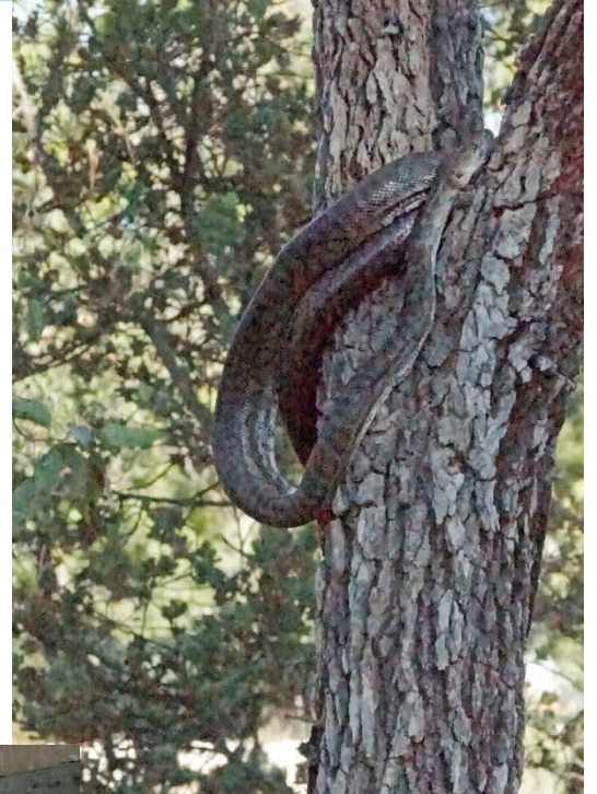
Above: Carpet python in a jarrah tree, Dawn Atwell Reserve