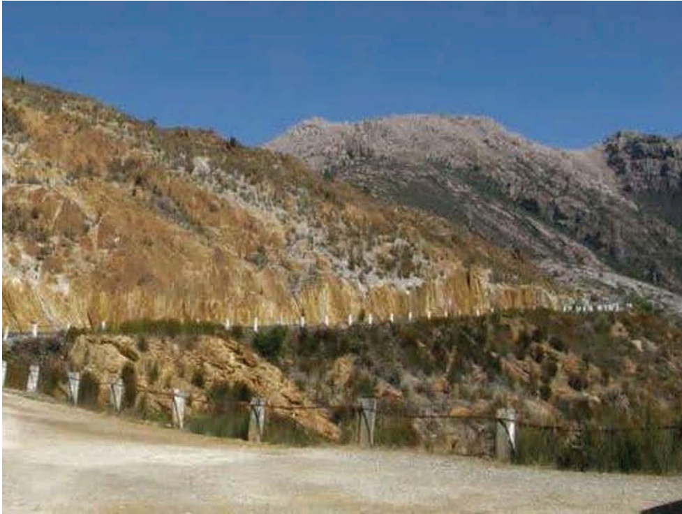
Left: The road down to Queenstown.

stripped of their vegetation to supply wood for the furnaces, soil erosion prevailed (the average rainfall for the area is close to 2,500 mm per annum) and the crushed rock and tailings (estimated to be 100 million tonnes) leached into the Queen River. These tailings are predicted to leach out for hundreds of years to come. The Queen River flows into the King River – which flows into Macquarie Harbour; the acidity killing all life in its wake. The pollutants to this day affect users of Macquarie Harbour – including the new trout and salmon farms!