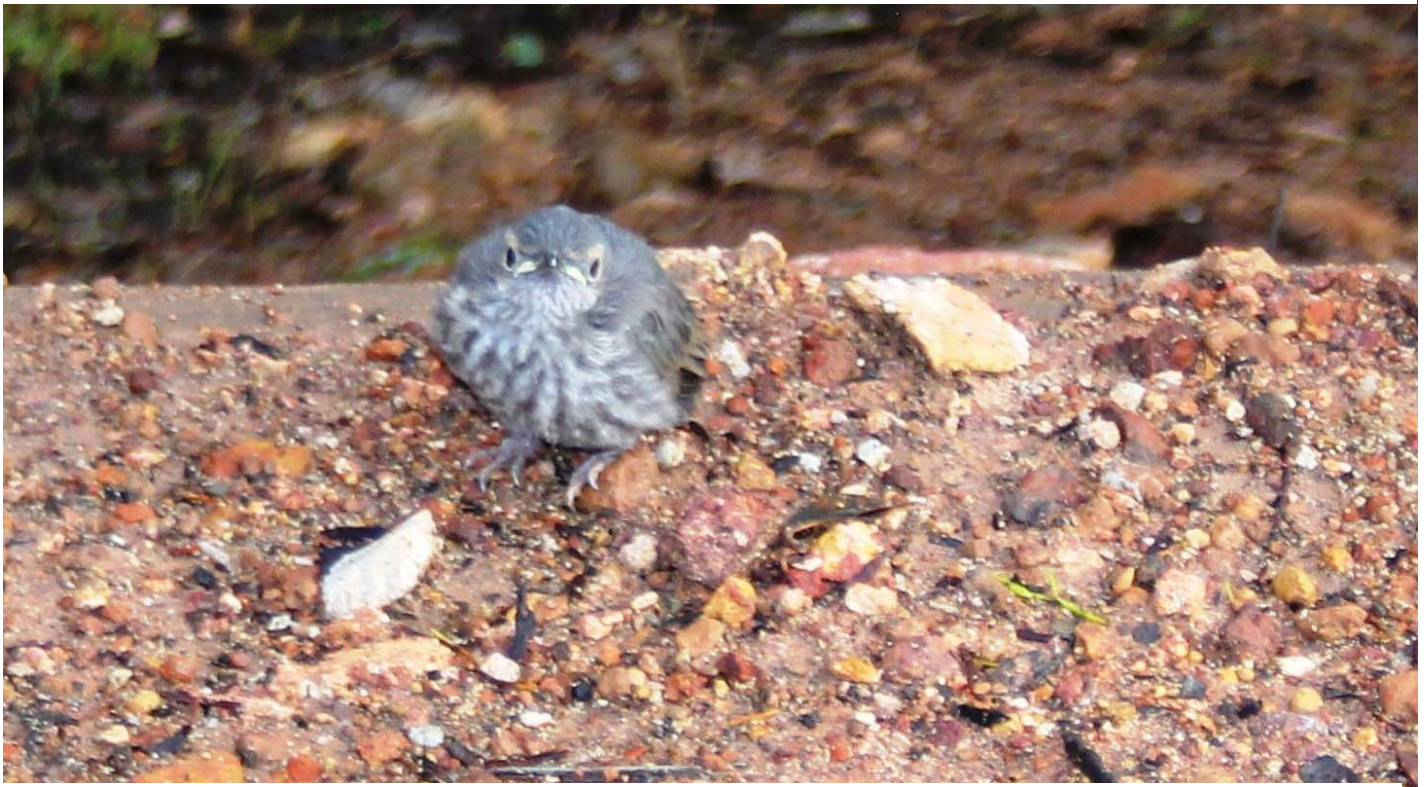
Above: A fledgling Singing Honeyeater after its first flight.