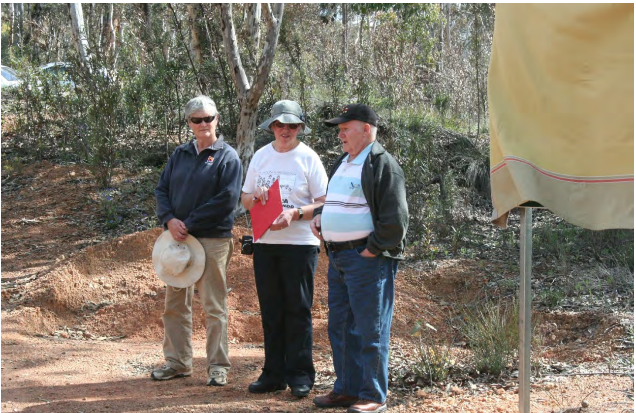
Above: The Opening of the Dawn Atwell Reserve on Julimar Road.