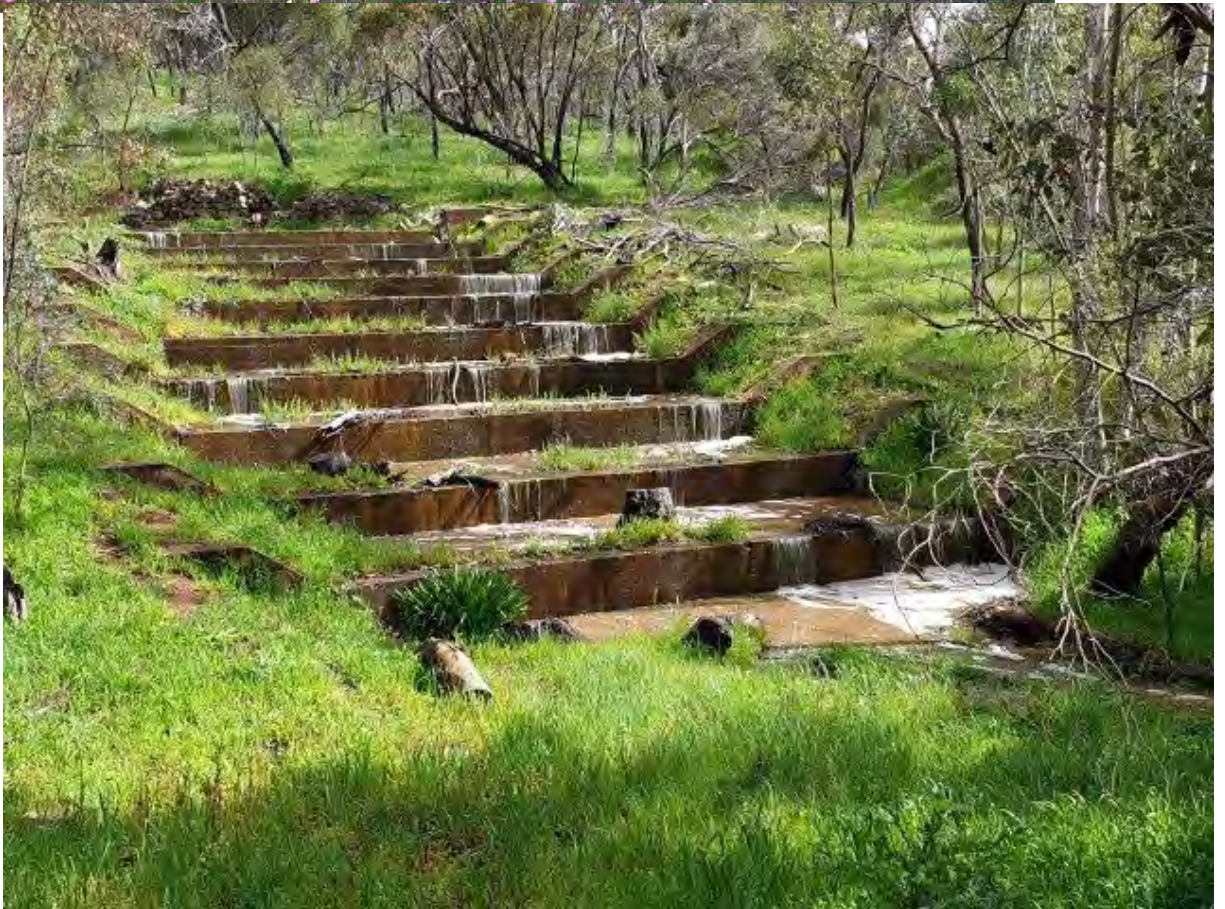
Top: Pelham Reserve, Duke Street Toodyay (2021-09-14) Bottom: Pelham Brook Spillway (2021-08-10)