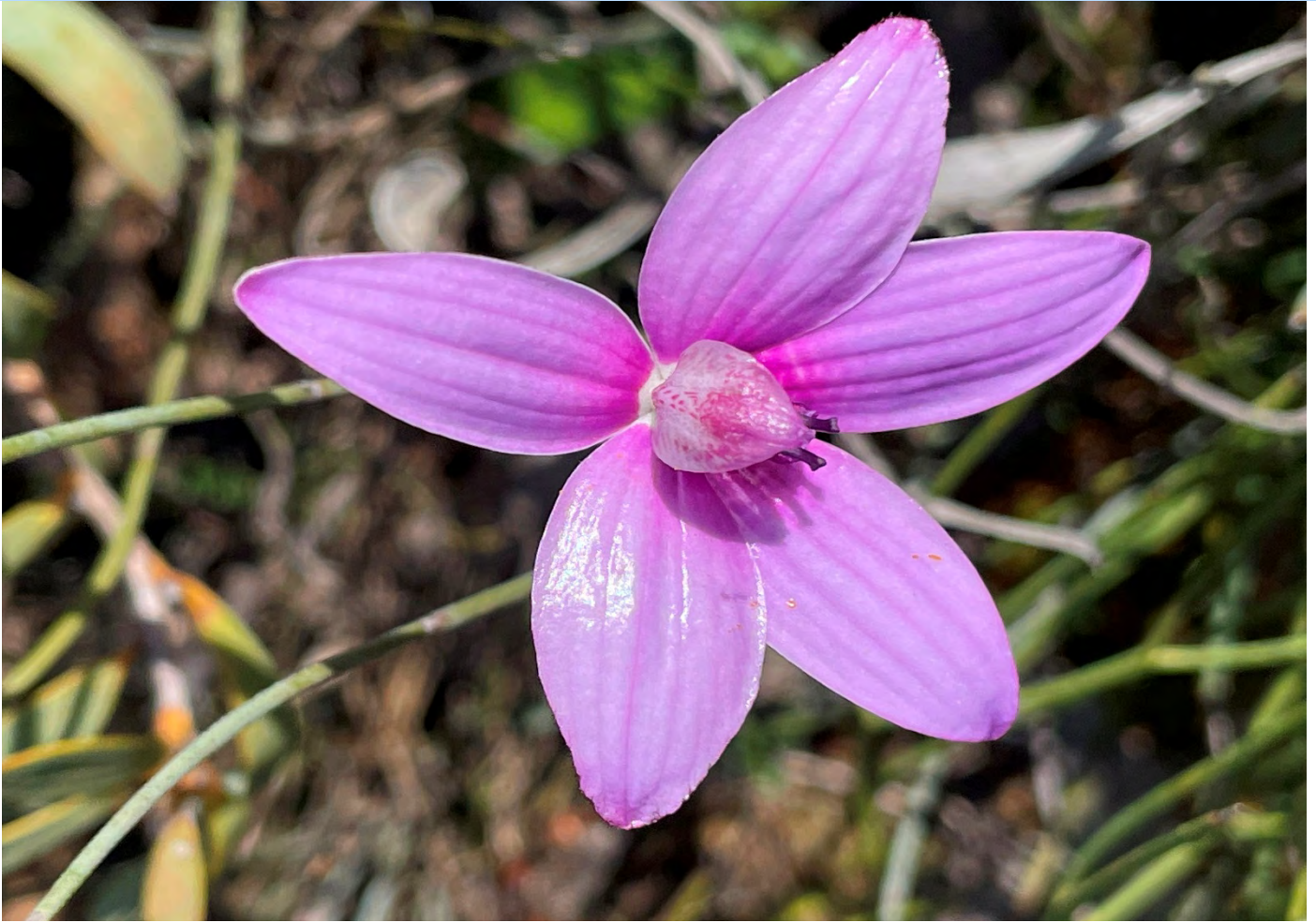
Above: A pink Enamel Orchid ( Elythranthera emarginata )