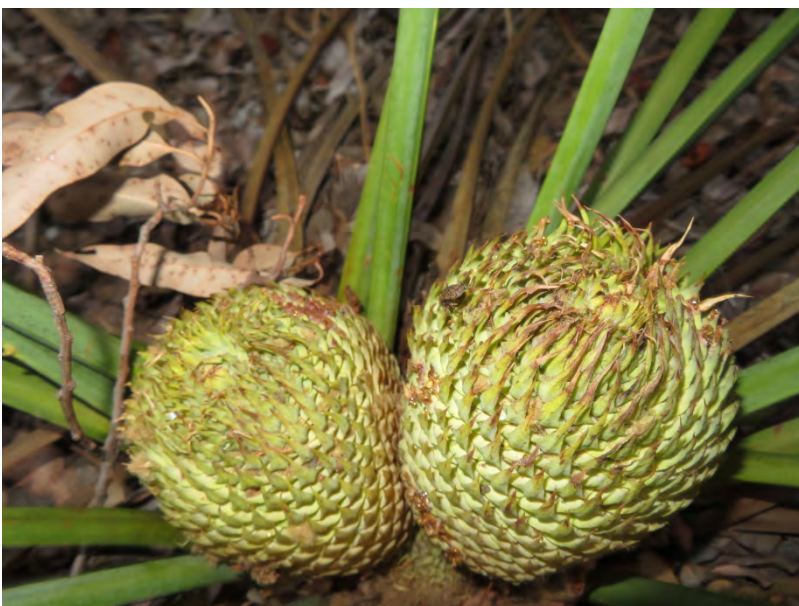
Left: Zamia Cycad (Macrozamia riedlii) from Karakamia.