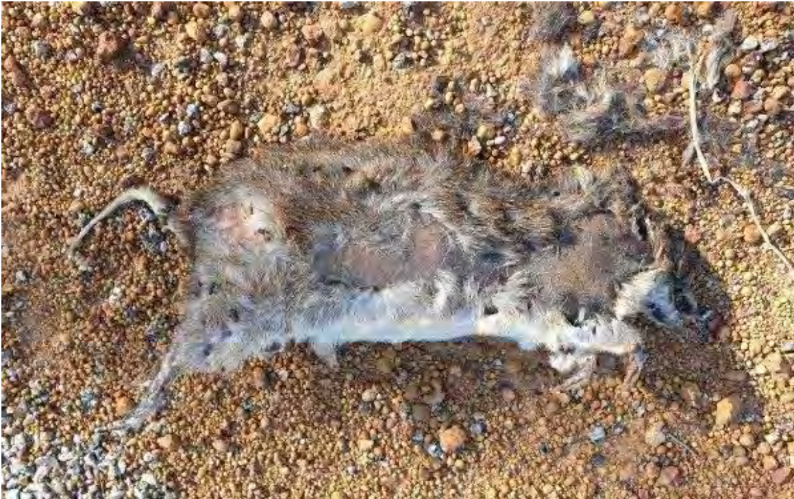
Above: The Evidence - we do have Quenda in Toodyay. Found on the side of the road near Springbank. The sighting has been further verified by a near neighbour.