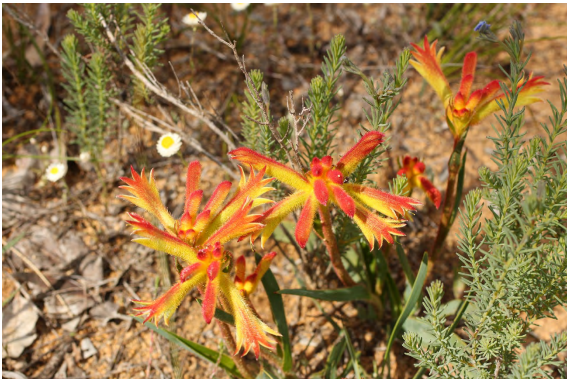
Above: Catspaw (Anigozanthus humilis) in the Rica Erickson Reserve

As 2021 draws to a close we are looking forward to planning another year of excursions and inspirational guest presenters. I would like to thank all the members for their wonderful support in 2021 and to wish everybody a very safe and happy Christmas.